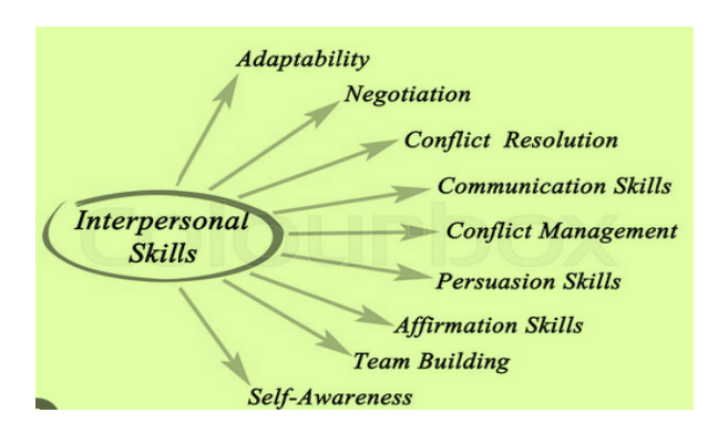
Fig. 1 Types of interpersonal skills

Interpersonal skills are the abilities that allow us communicate effectively, build to relationships, and work well with others. They are essential for success in any workplace, regardless of the industry or role. Interpersonal skills, also known as people skills, are the capacity to communicate efficiently, construct relationships & collaborate. Employees with strong interpersonal skills are more likely to be productive, innovative, and satisfied with their jobs. Strong interpersonal skills can improve communication. effective collaboration. motivation and engagement, and strong leadership skills. As a result, businesses can create a more productive, innovative, and satisfying work environment for everyone involved. Here are some of the factors of interpersonal skills that influence employee performance: